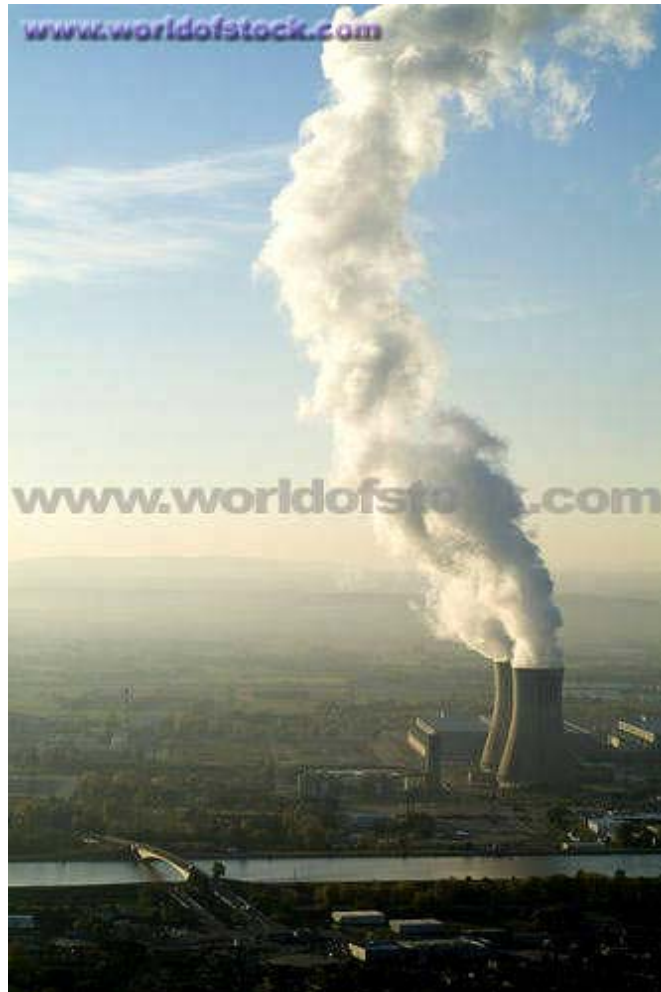
Steam and water vapor from cooling towers at the Tricastin Nuclear Power Plant located in the Rhone River Valley, Drome, France

Contrary to existing belief, nuclear power plants do indeed discharge greenhouse gas emissions (GHG) in the form of water vapor—the most severe of all the greenhouse gases.