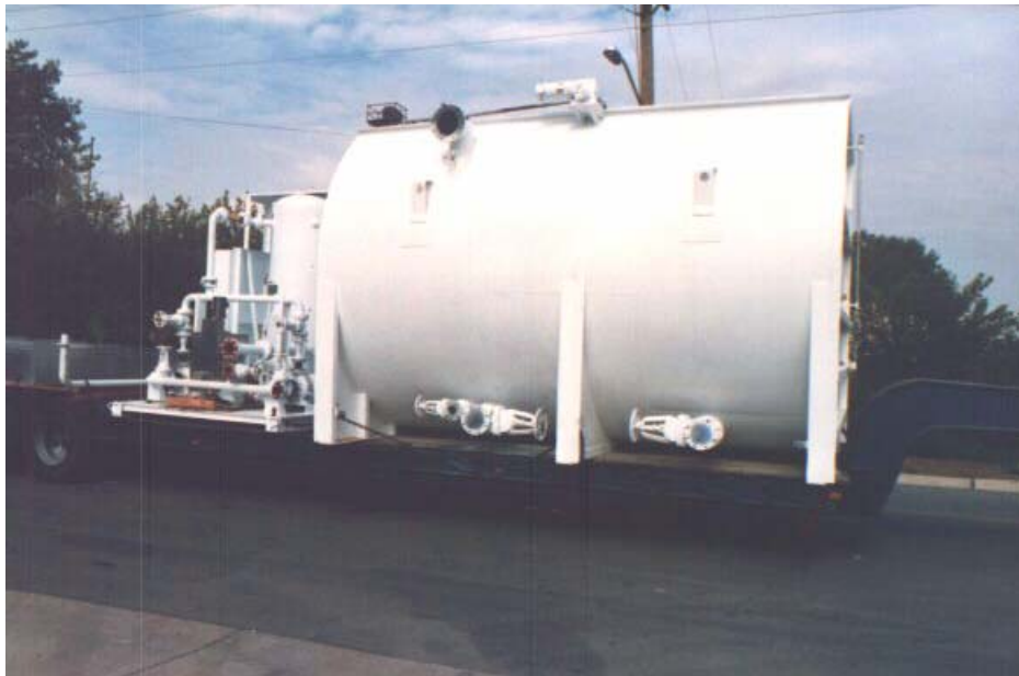
800 GPM Combination Gravity Separator/DAF Separator in Seismic Zone 4 epoxy painted steel construction loaded for shipment to the Department of Water and Power, City of Los Angeles, California.