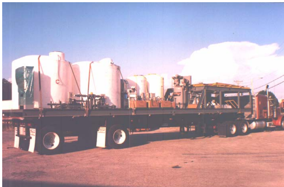
Skid Mounted 40,000-GPD Aqua-Round IV™ Truckwash Treatment And Water Recycling System With "Spot Free" Final Rinse.

Location: North Rescue Station, Charleston, SC Contractor: Hill Construction Corporation Engineer: US Navy Installation Date: 1995