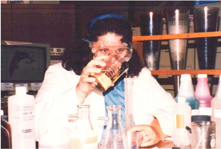
Laboratory Technician performing analytical testing.

"Theory Guides- Experimentation Decides"