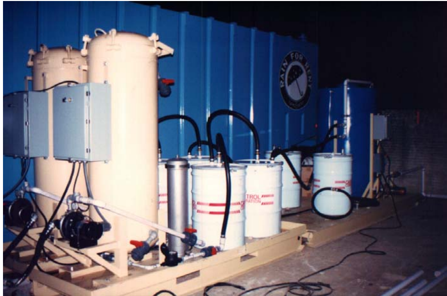
Two side-by-side 15 GPM ContamAway II™ plants built for the 1993 Airport Clean-Up project at Andrews AFB in Maryland.

Pulse Blender/Static Mixer The RipTide™ makes use of hydraulic shear rather than mixer hardware elements to blend coagulants and flocculants with water. The product's design prevents plugging, improves mixing action, and reduces pressure drop. It can be used in either a vertical or horizontal position and easily accommodates all treatment chemicals and feeder devices. WSE Publication No. 498